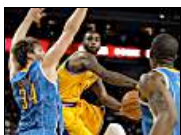
'D' keys Warriors' win over Hornets