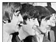
Rock 'n' rollers of the '60s (photos)