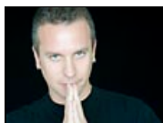
Sinner! What are you guilty of now?