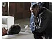
New 'Criminal Minds' shines