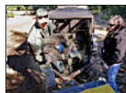
Black bear orphans returned to wild